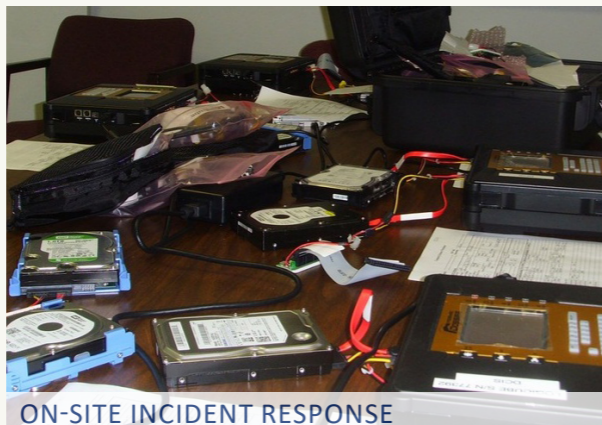
ON-SITE INCIDENT RESPONSE