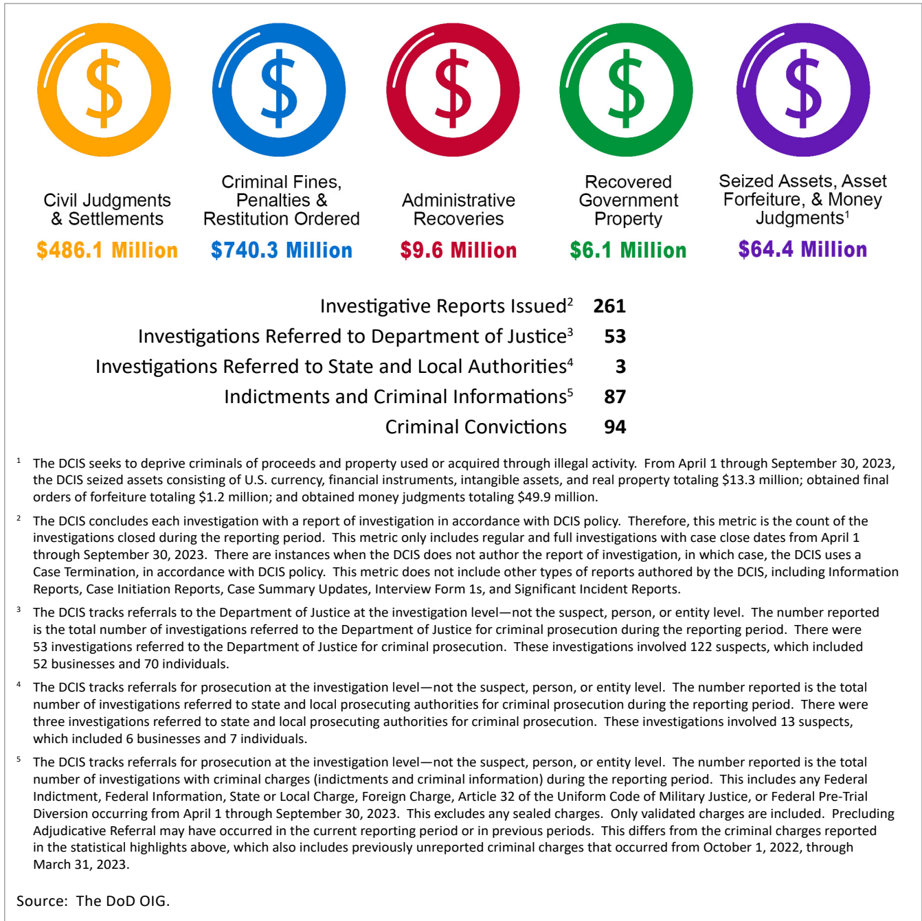
Figure 2. DCIS Statistical Highlights

The DCIS investigates criminal matters related to DoD programs and operations.